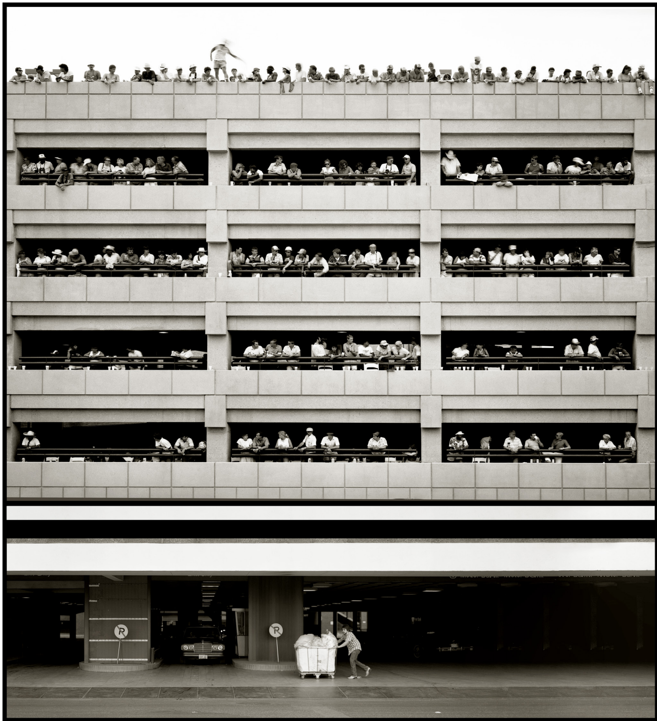
City Spaces 2