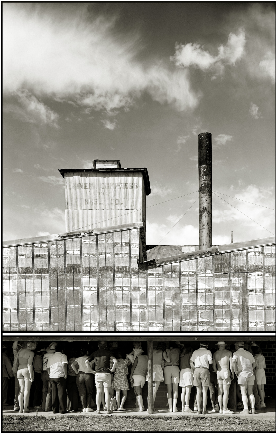
City Spaces 3