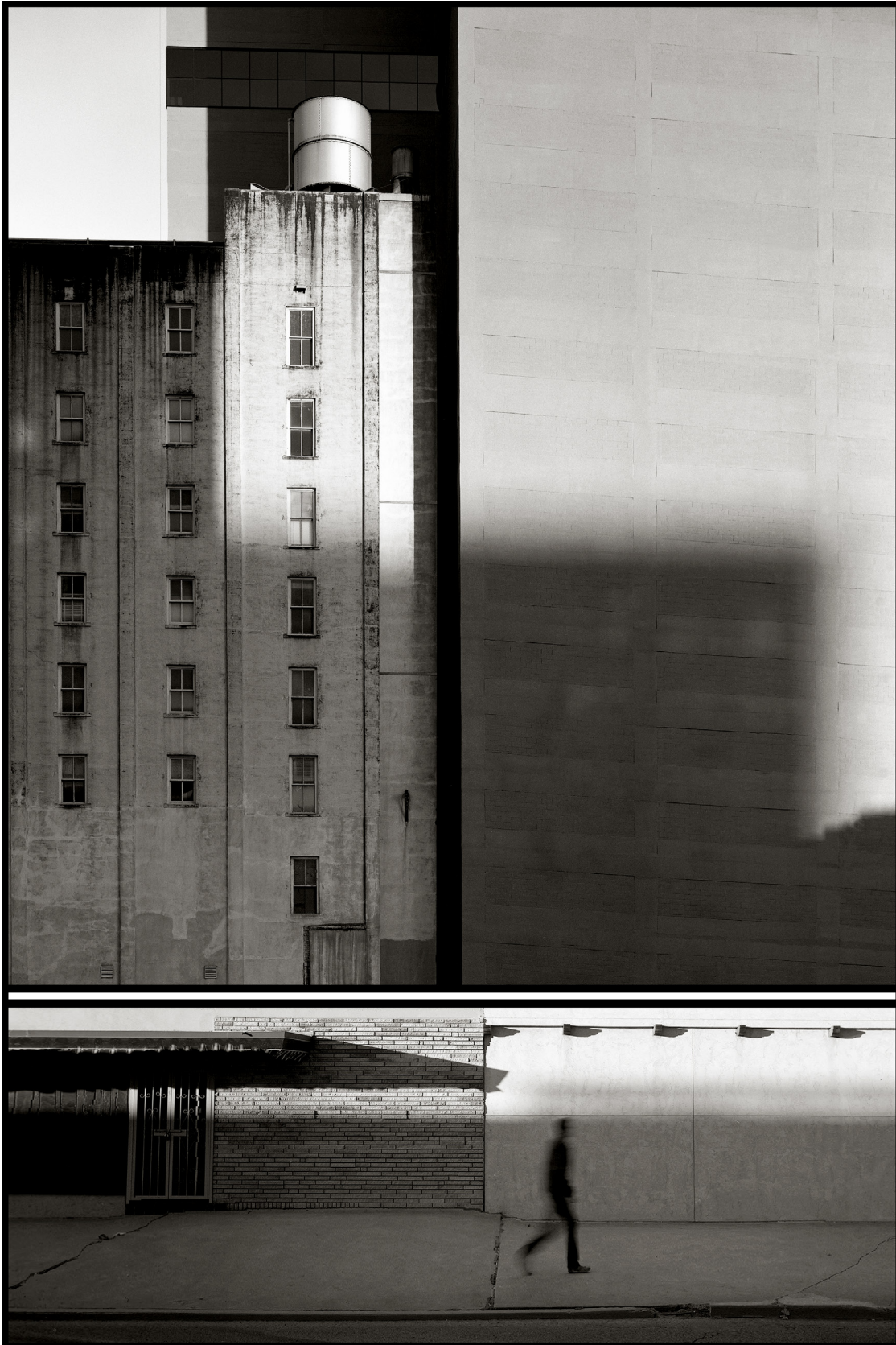
City Spaces 1