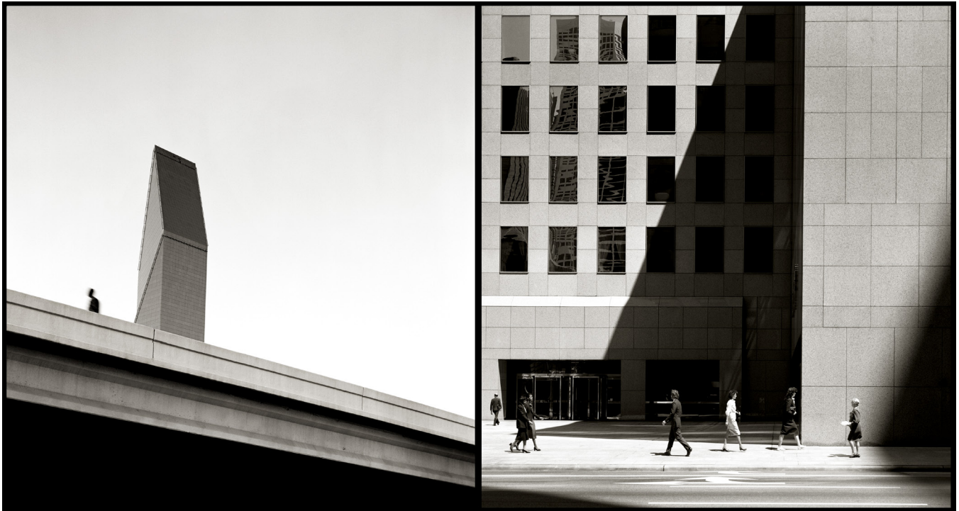
City Spaces 6