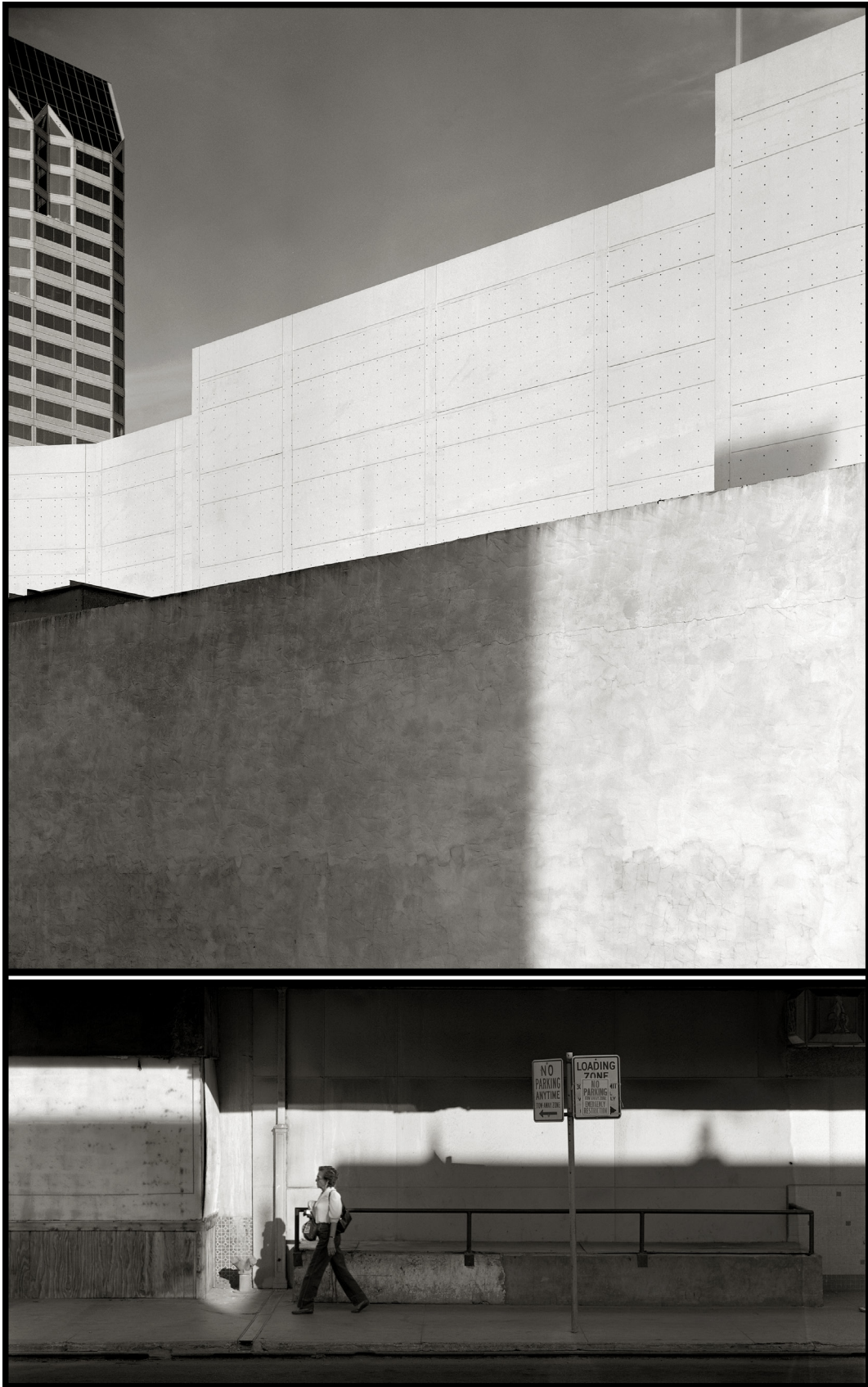
City Spaces 5