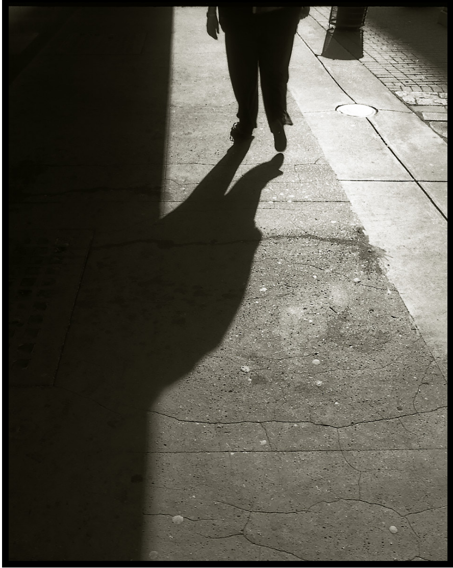
City Spaces 9