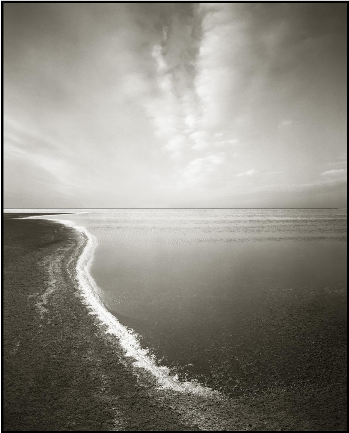
Water & Sky #8