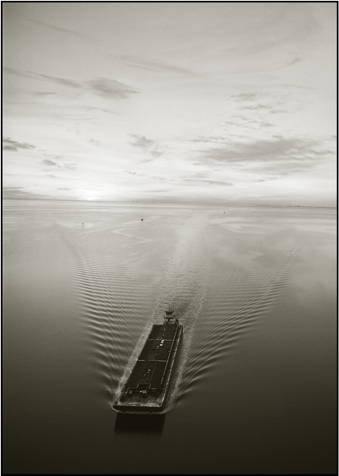
Water & Sky #6