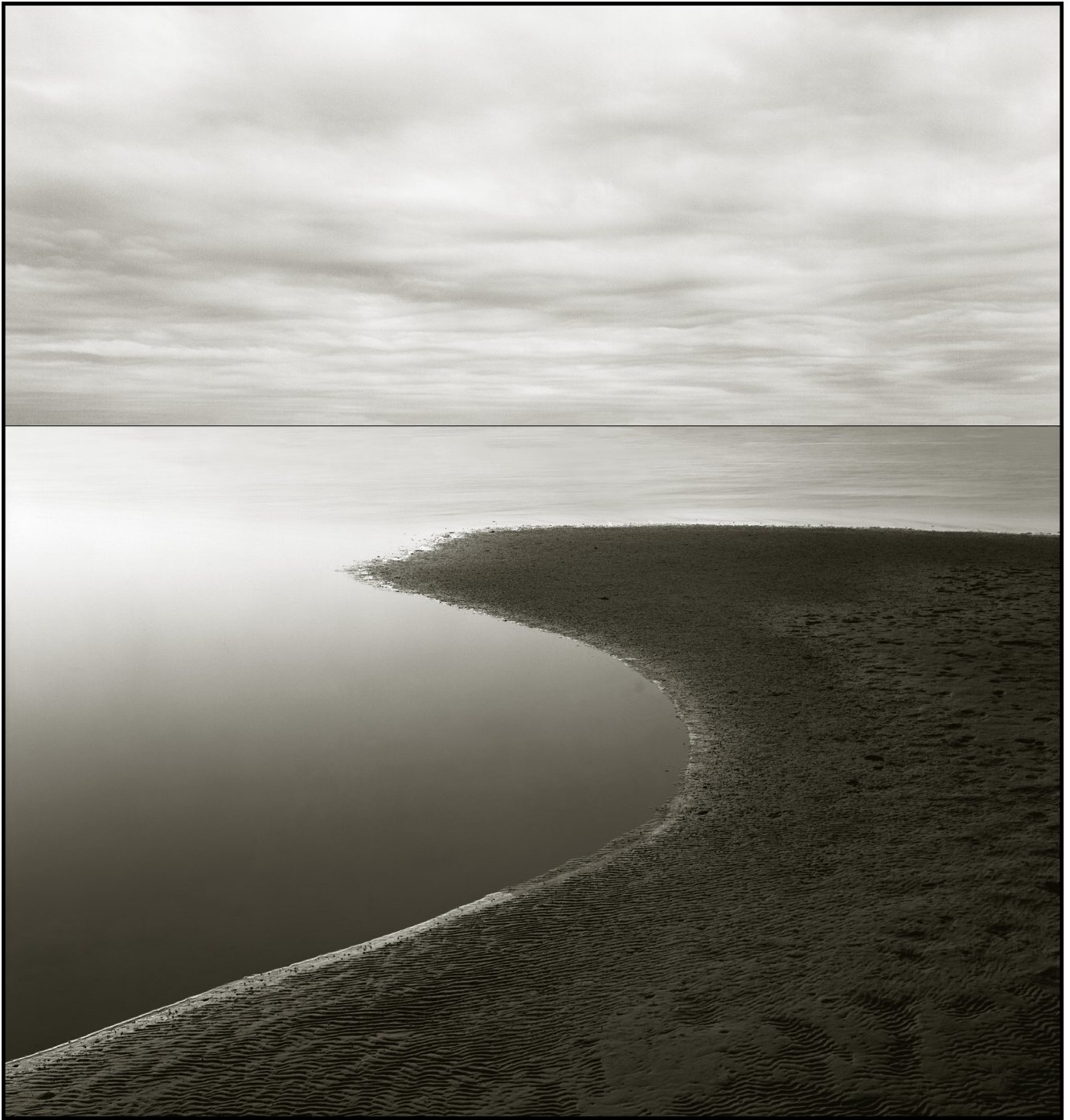
Water & Sky #2