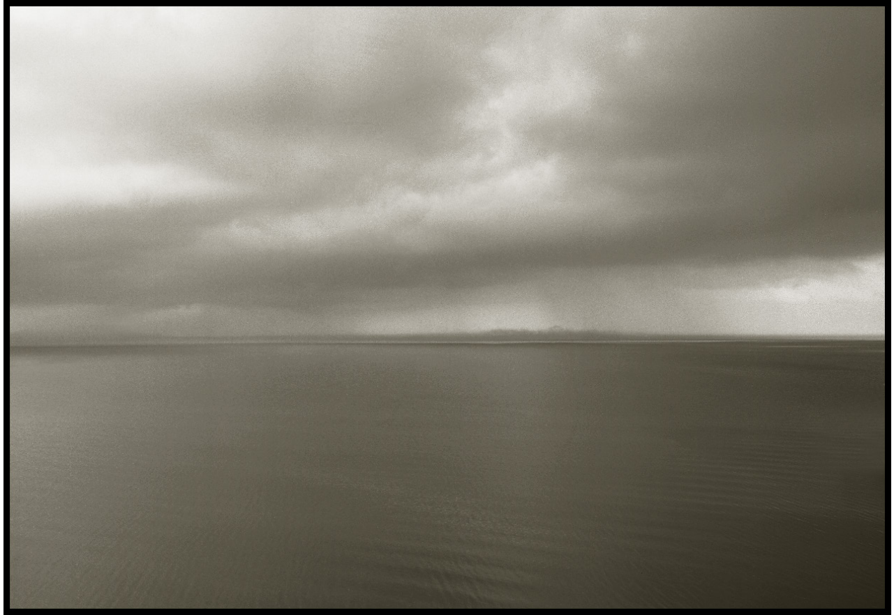
Water & Sky #5