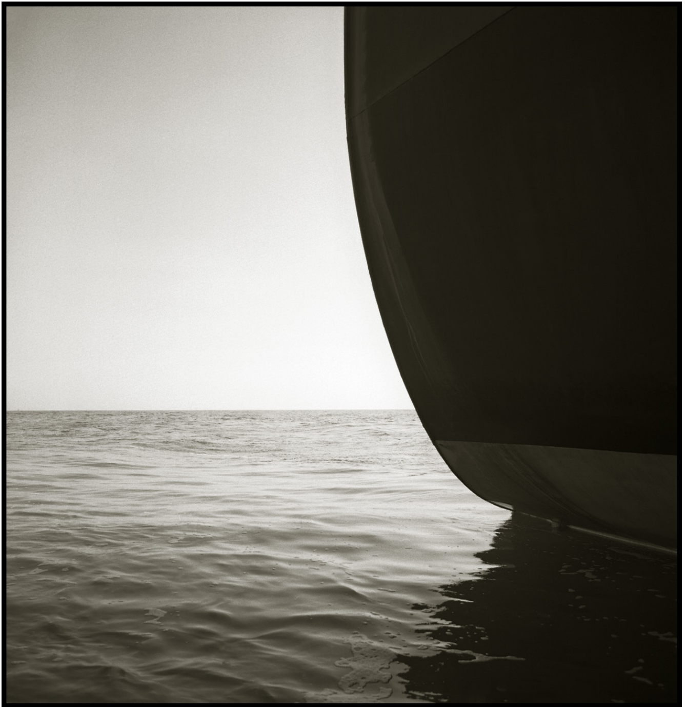
Water & Sky #9