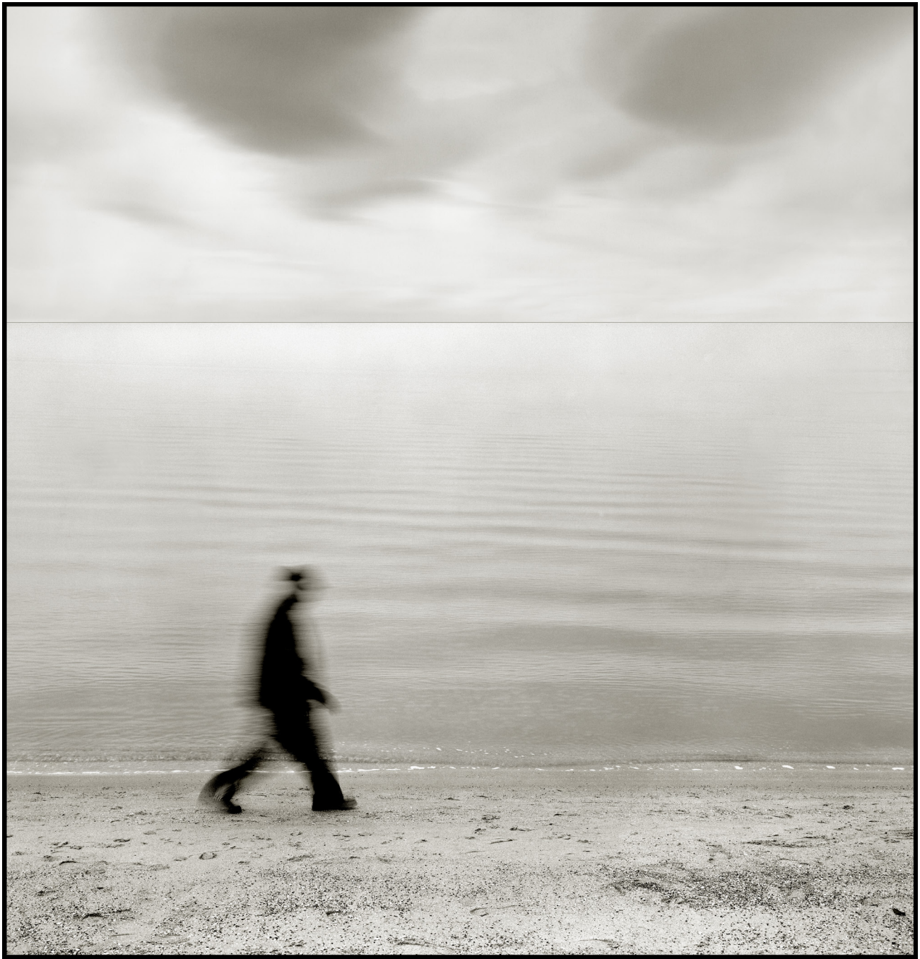
Water & Sky #3