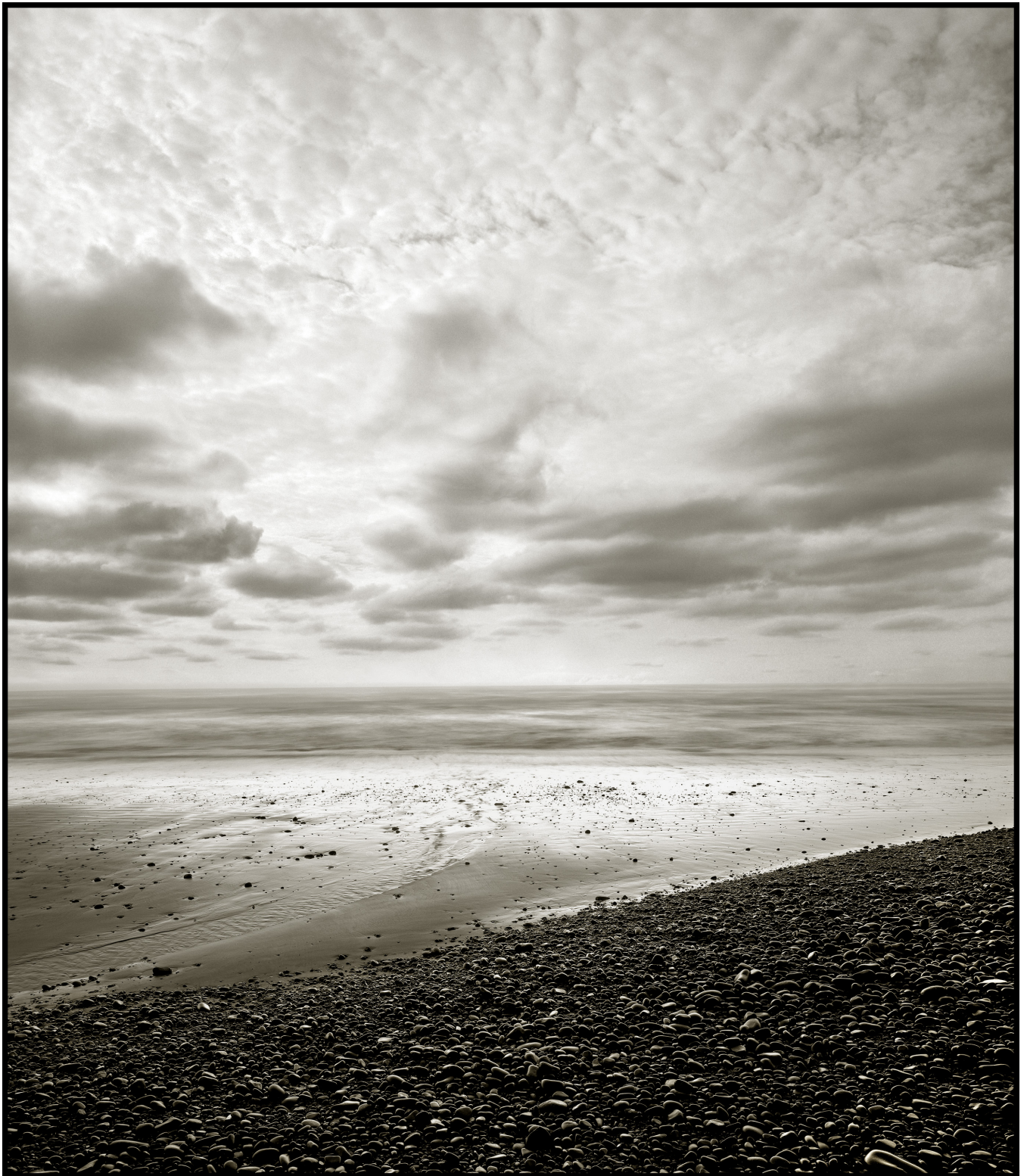
Water & Sky #7