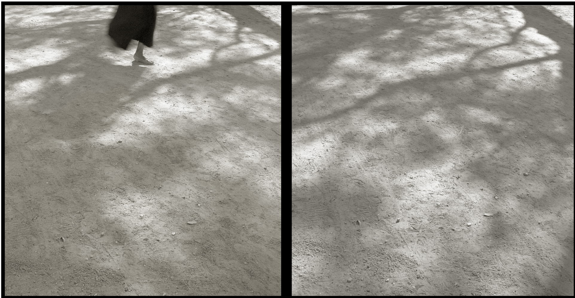
Unforseen - Six