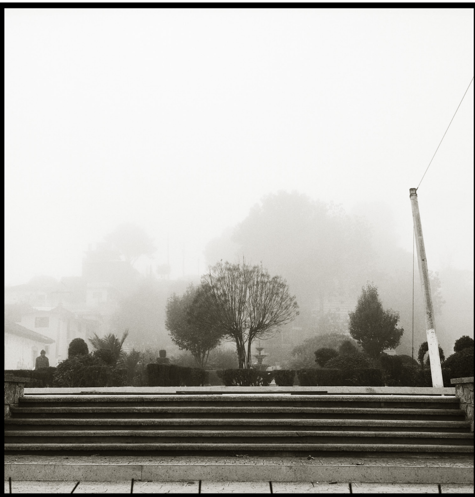
Unforeseen - Four *