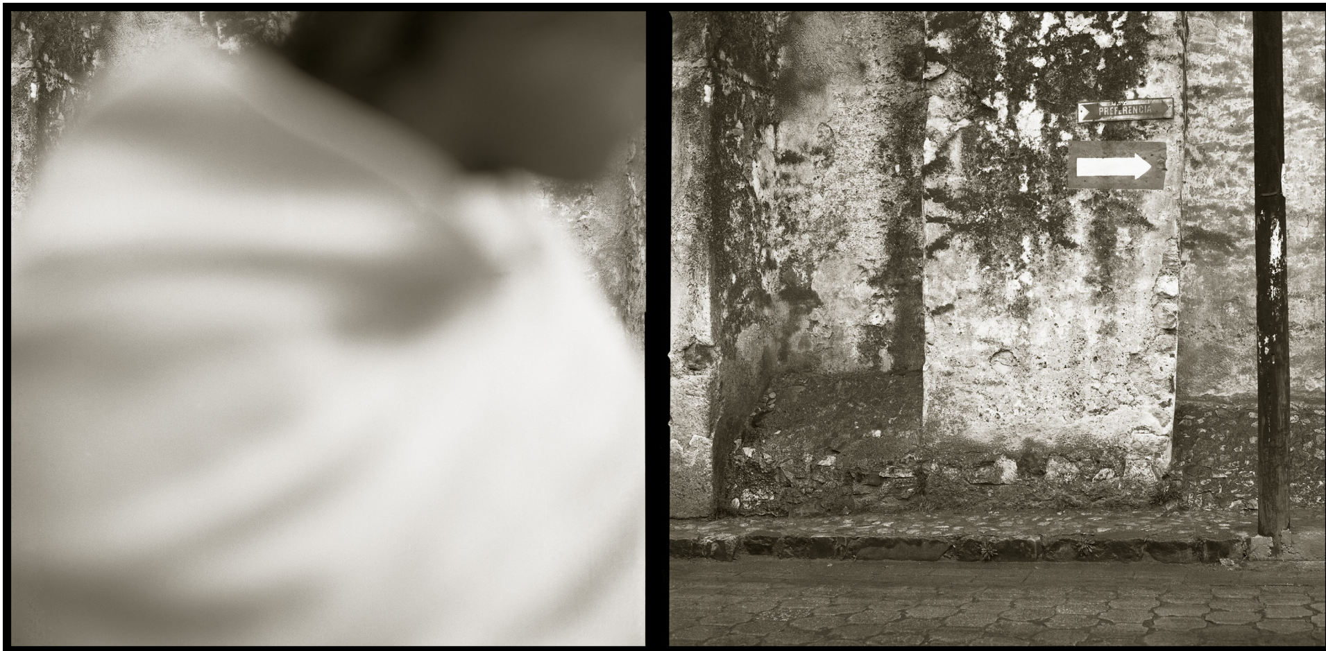
Unforseen - Eight