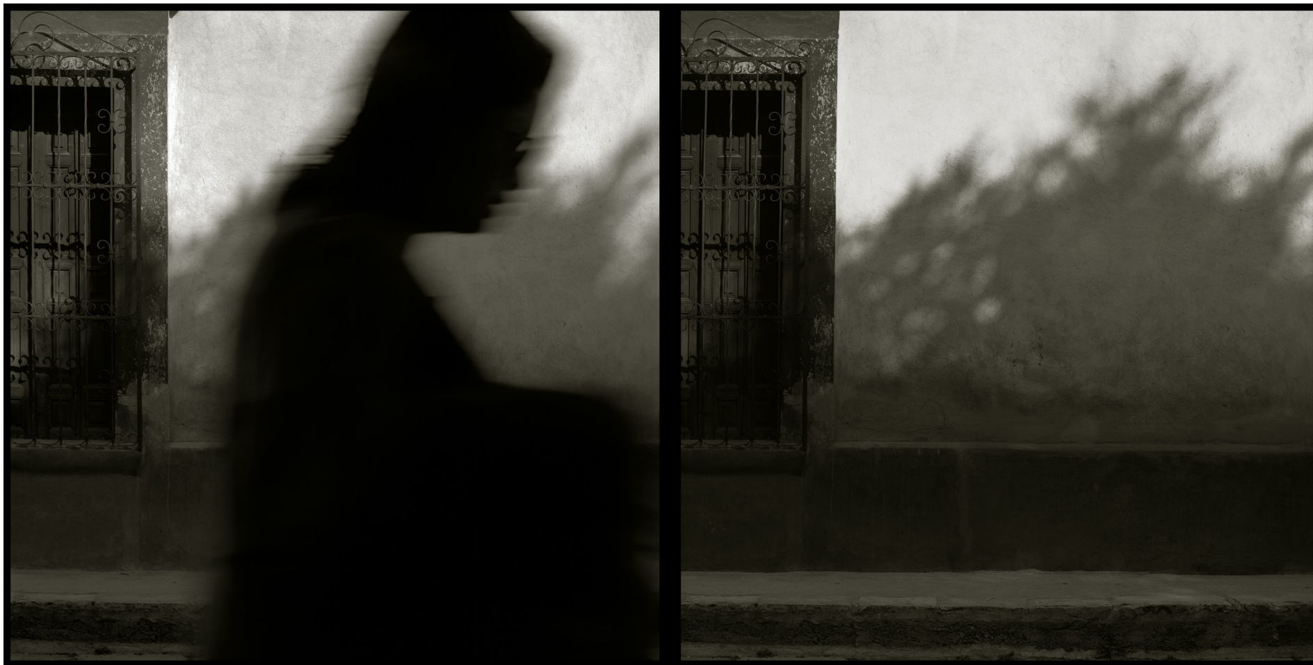
Unforeseen - Two