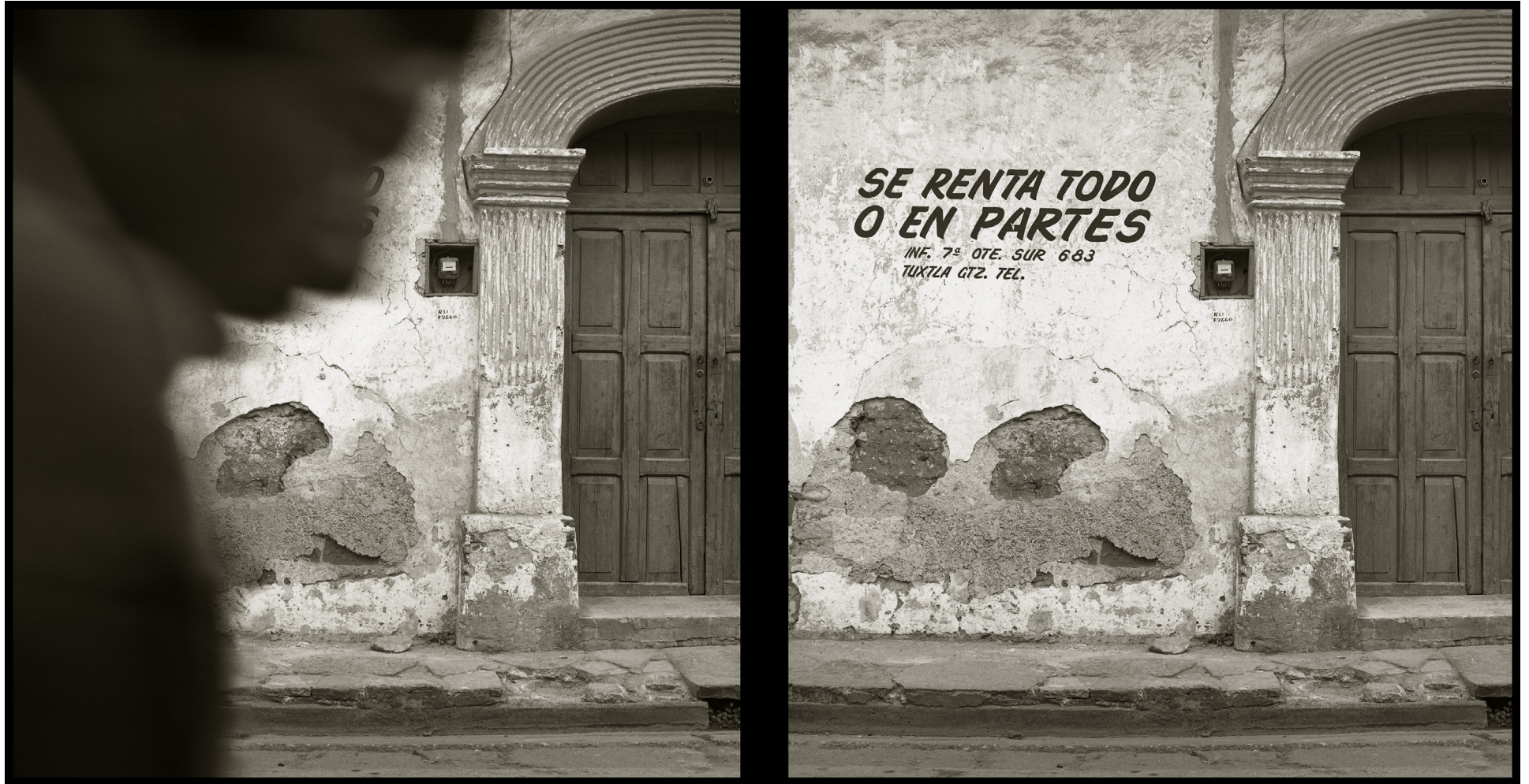
Unforeseen - Three