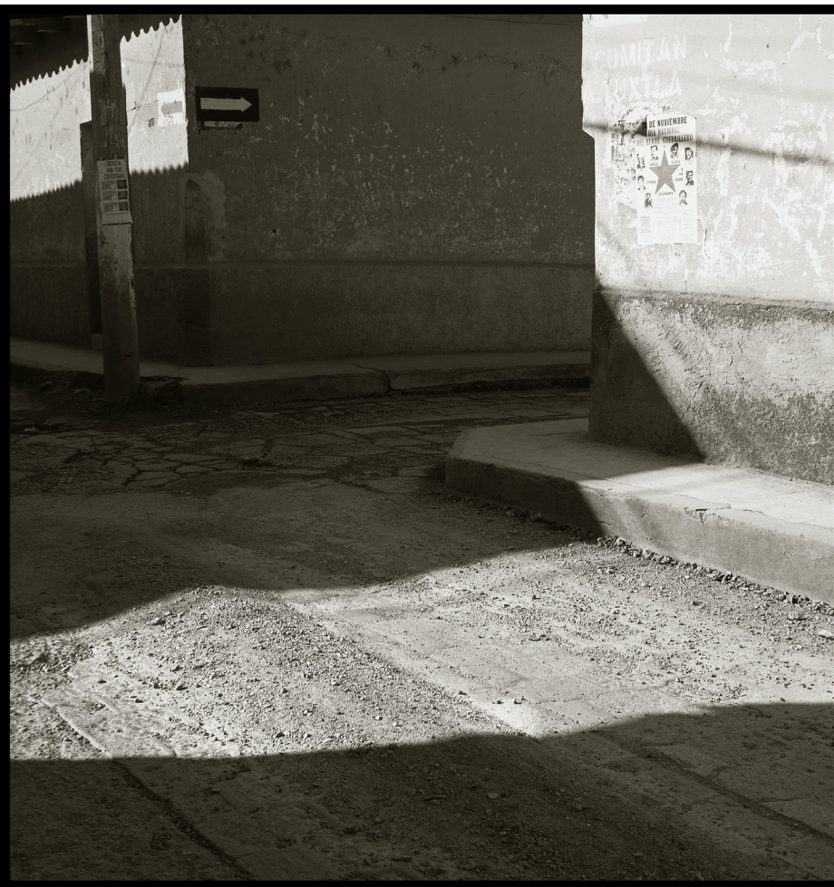
Unforeseen - One