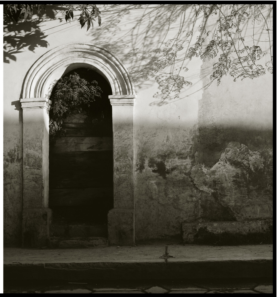
Unforseen - Seven